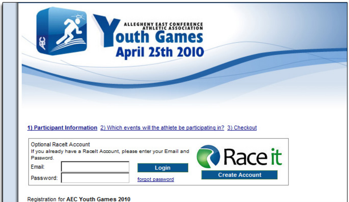
Figure 1 RaceIt Registration